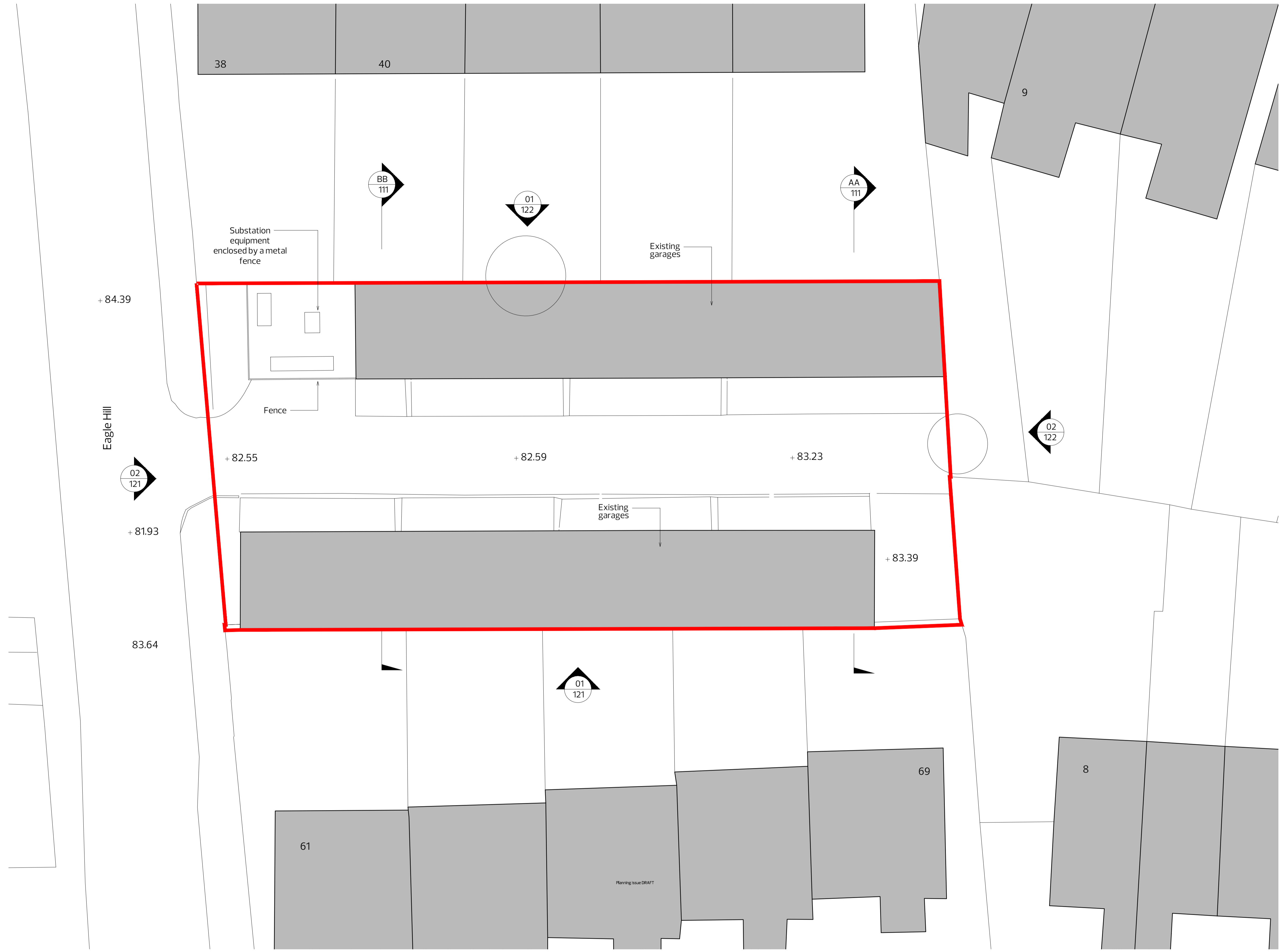
01_EXISTING ROOF PLAN