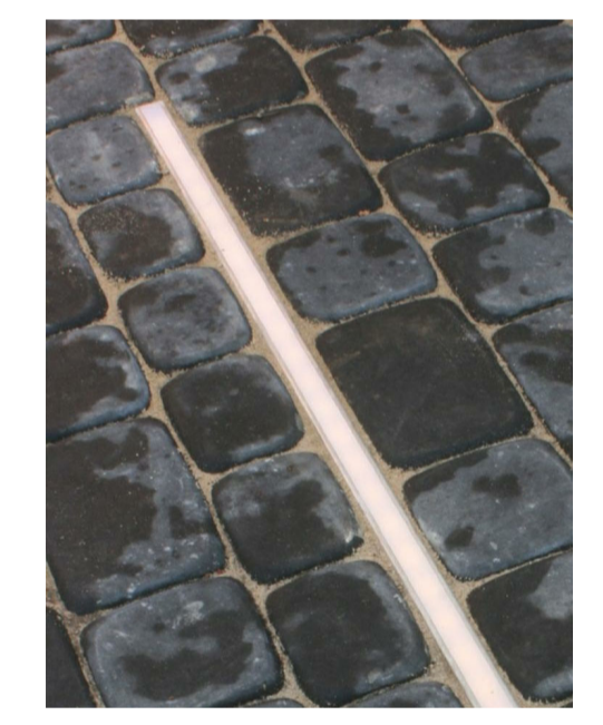
Reference image of LED Strip lighting